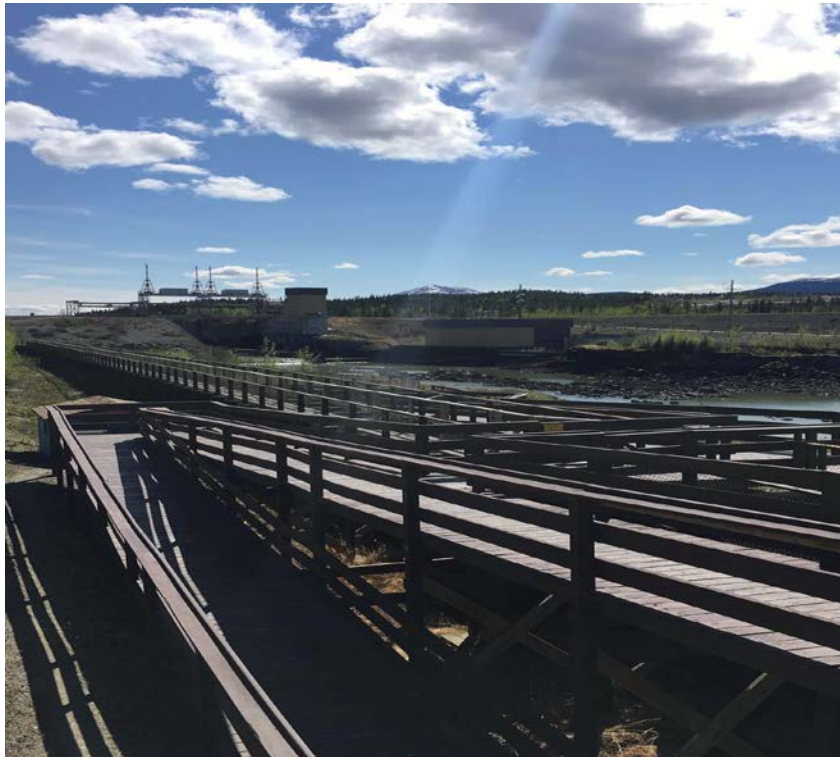
Photo from the top of upper deck of the Fish Ladder- taken May 2018

Ashley Brown Emilie Major-Parent Brittany Key