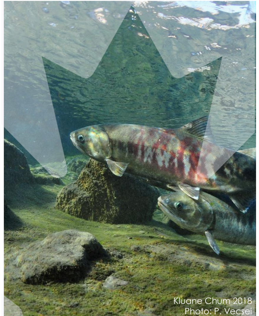
Kluane Chum 2018